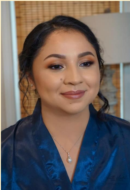
SOFT EYESHADOW LOOK