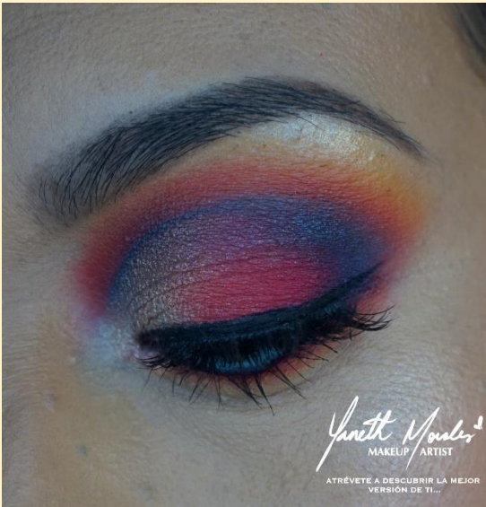
ARTISTIC EYESHADOW LOOK