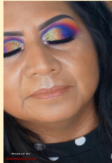
ARTISTIC EYESHADOW LOOK