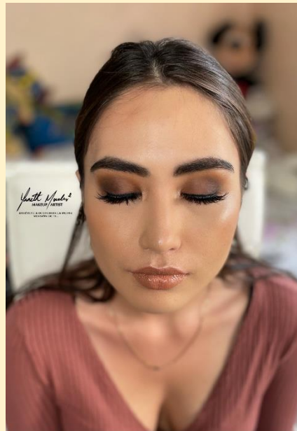
SMOKEY EYESHADOW LOOK