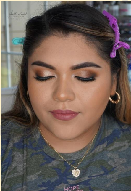
CLASSIC GRADIENT EYESHADOW LOOK