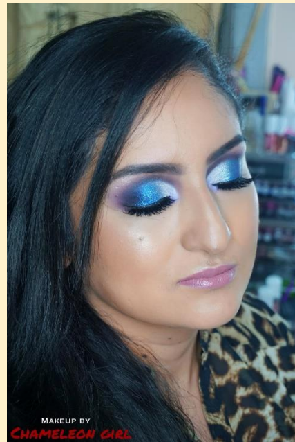
SEMI CUT CREASE EYESHADOW LOOK