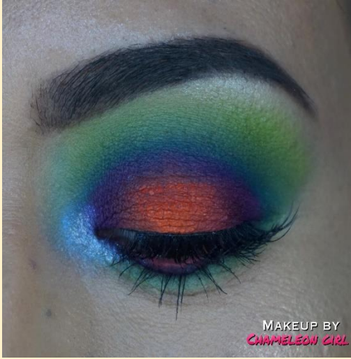
MIDDLE CUT CREASE EYESHADOW LOOK